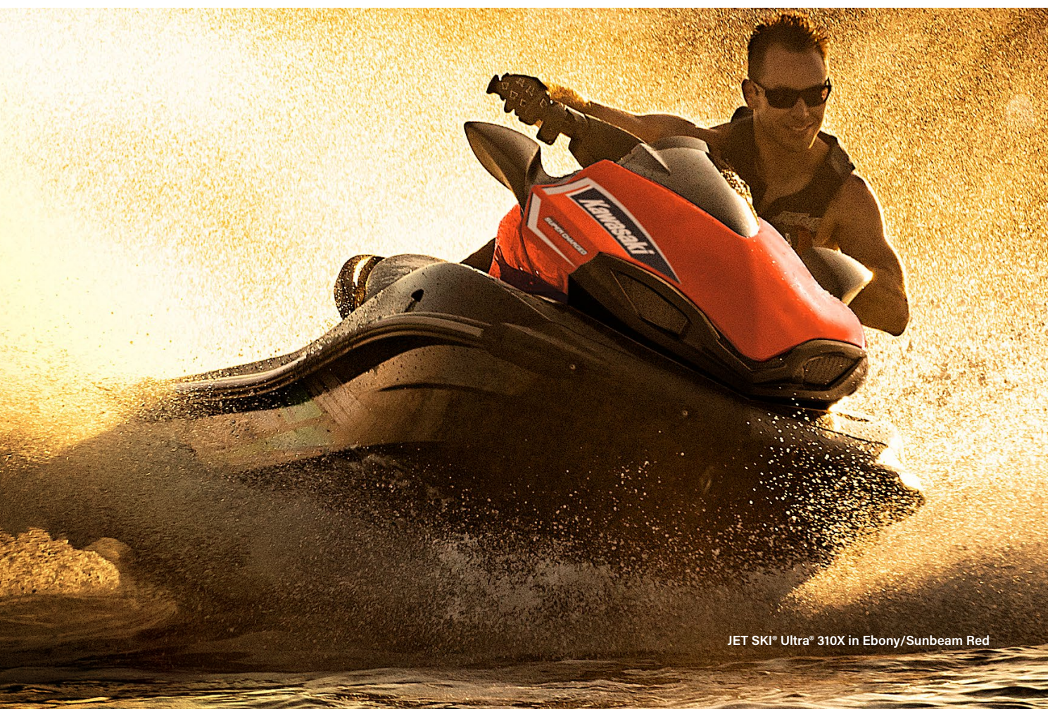
JET SKI® Ultra® 310X in Ebony/Sunbeam Red

Gain the sporting edge on the water with the JET SKI® Ultra® 310X SE watercraft. The most powerful production personal watercraft in the world adds a sport seat for enhanced comfort and special edition paint and graphics. Take the incredible performance of the JET SKI Ultra 310X SE to new levels—go the distance or simply enjoy a full day on the water with peak power and sporting comfort.