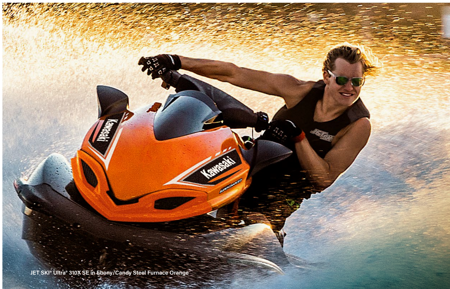
JET SKI® Ultra® 310X SE in Ebony/Candy Steel Furnace Orange