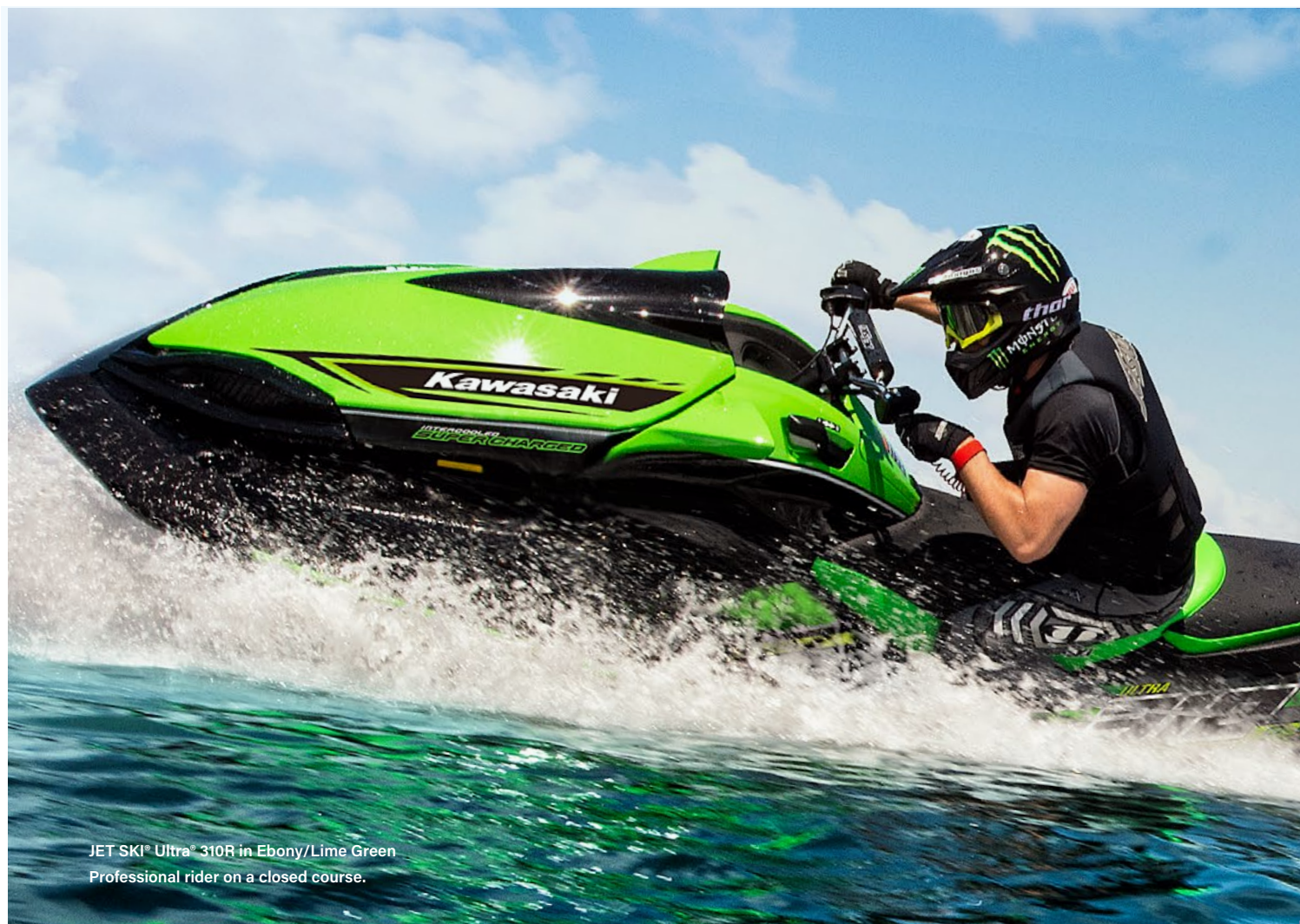
JET SKI® Ultra® 310R in Ebony/Lime Green Professional rider on a closed course.