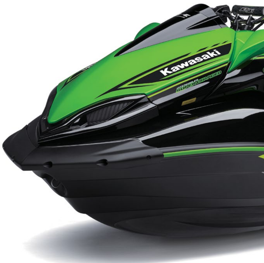
JET SKI® Ultra® 310R in Ebony/Lime Green

The advanced deep-V hull design is inspired by Kawasaki's championship-winning race machines, with a 22.5-degree hull angle that allows the watercraft to penetrate swells and waves with great efficiency and less shock. Tuned sponsons help provide straight-line stability and high-grip performance in turns.