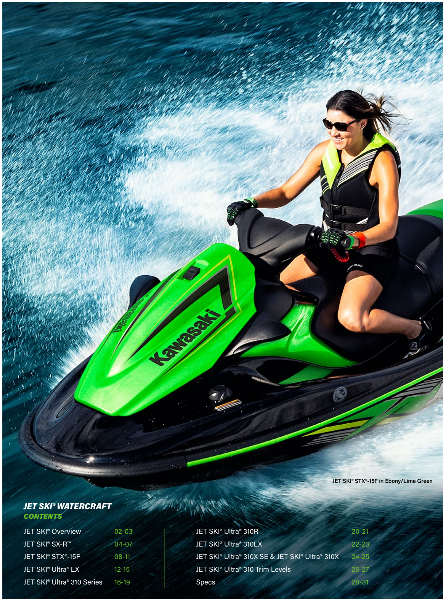
JET SKI® STX®-15F in Ebony/Lime Green