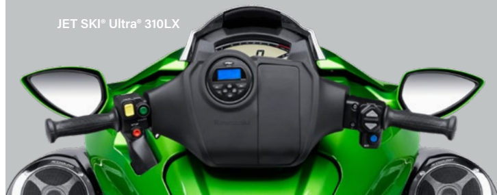
JET SKI® Ultra® 310LX

The Electronic Throttle Valve (ETV) is controlled by the Electronic Control Unit (ECU) and allows multiple riding modes to be activated. Cruise through no-wake zones with one-touch 5 mph mode, while Fuel Economy Assistance mode optimizes fuel efficiency. To aid newer riders, the key-activated Smart Learning Operation (SLO) mode reduces engine power output and top speed.