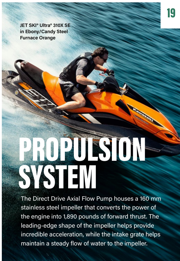
JET SKI® Ultra® 310X SE in Ebony/Candy Steel Furnace Orange

Electric Trim-Control (ETC) system is an advanced feature that allows the rider to adjust handling characteristics. The ETC controls the angle of the jet pump nozzle to adjust the hull attitude for specific water surface conditions or riding style.